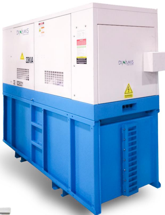
33kVA 1000l antitheft